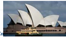
Australia Offers Visa for Millionaires