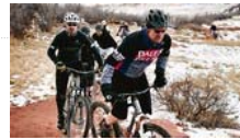
A Colorado Brewer Mixes Conquering the Beast Exercise With Beer The Roaring Riviera

Local's Museum // Museo Cerralbo. A Madrid insider cannot be worthy of that name without recommending this museum near the Plaza de España. It houses what was the personal collection of the 17th Marquis of Cerralbo—everything from sculptures and paintings to coin collections and tapestries. Ventura Rodríguez, 17;