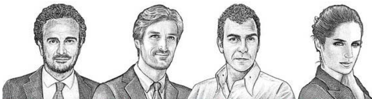
The Decorator Lorenzo Castillo The Aristocrat Duke Rafael de Medina Abascal The Chef Ramón Freixa The Tastemaker Carolina Herrera de Baez